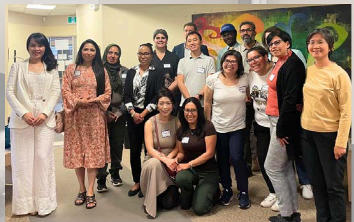
IAT Committee members

Comprised of 20 active community members, the IAT launched its first meeting of 2025 in collaboration with the PEI PIP team—marking an exciting start to a new year of engagement and impact.