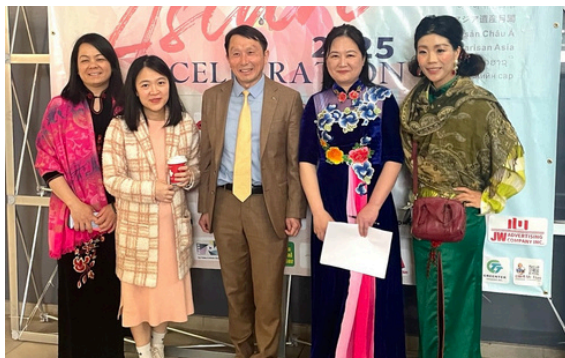
Asian Heritage Month, May 2025