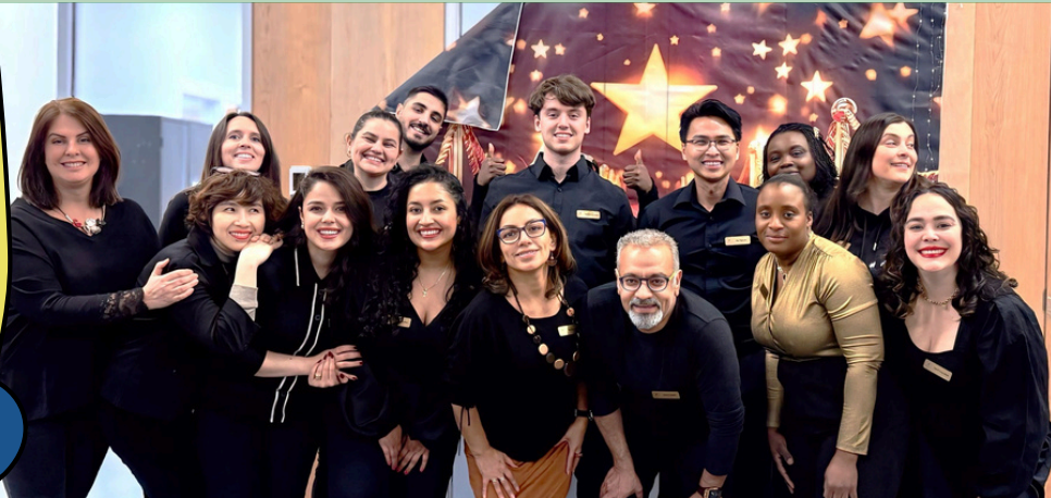
IRSA team photo on Volunteer Appreciation day, April 2025

Welcome to PEI PIP's First Quarter Snapshot for 2025! We're excited to share highlights from the past three months, showcasing the PIP team's efforts, impactful partnerships, and meaningful collaborations—all in support of building a stronger, more inclusive community.